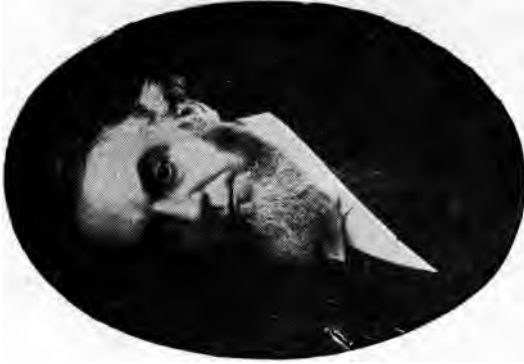
CHAS. T. RUSSELL