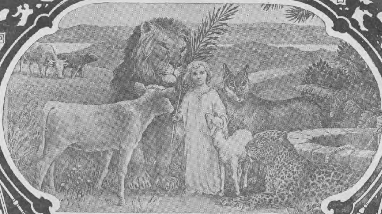
Isaiah 11:6.—The Prophet's symbolical picture of peace and good-will in the earth when Messiah reigns.

INTERNATIONAL BIBLE STUDENTS ASSOCIATION